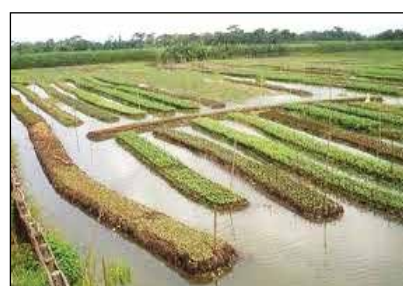
Floating vegetable cultivation