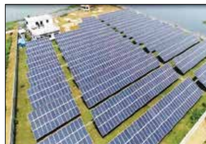
Solar Mini-Grid Plant