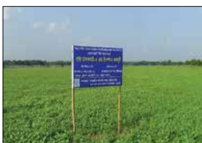
Drought tolerant crops