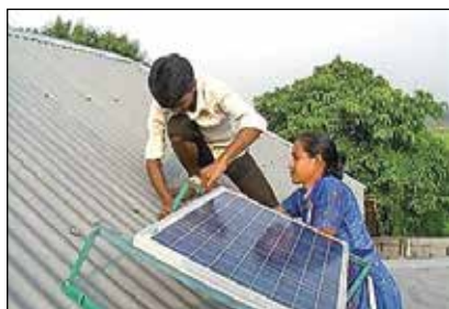
Solar Home System