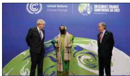
Hon'ble Prime Minister of Bangladesh, H.E. Sheikh Hasina, welcomed in COP26