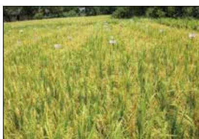
Salinity tolerant crops