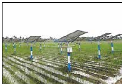
Agrivoltaic Solar Power Plant