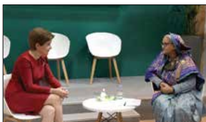
First Minister of Scotland H.E. Nicola Sturgeon meet with Hon'ble Prime Minister of Bangladesh, H.E. Sheikh Hasina at Bangladesh Pavilion in COP26